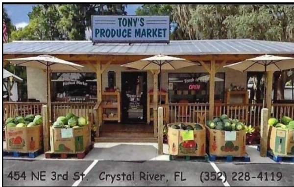
454 NE 3rd St. Crystal River, FL (352) 228-4119